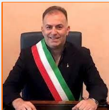
OTTAVIO DE MARTINIS Mayor of Montesilvano