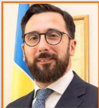
MATTEO PERAZZETTI Mayor of Città Sant'Angelo

Greetings from the Mayor Matteo Perazzetti